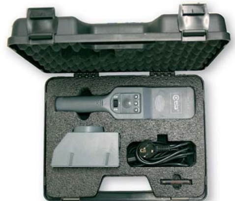
V140 CARRYING CASE